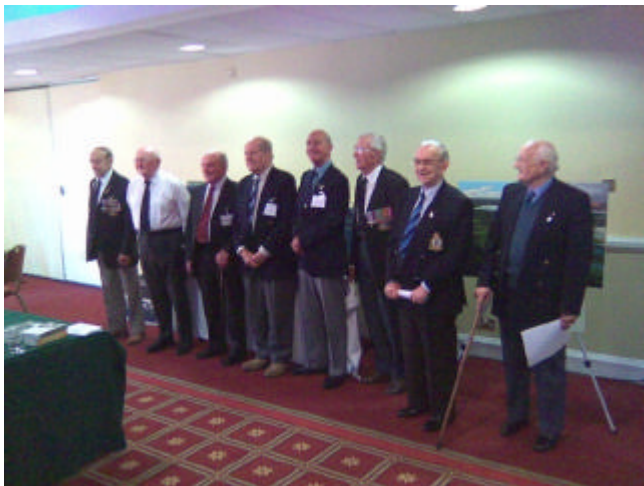
I decided against shouting out 'Rook!'

The icing on this particular cake were the guests some of whom later spoke about their experiences.