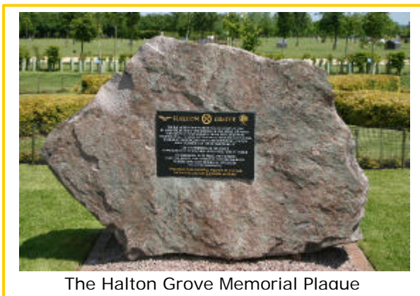
The Halton Grove Memorial Plaque

The June committee meeting had been arranged to be held at the National Memorial Arboretum, Alrewas, Staffordshire on Saturday, 13 th June, which coincided with the Service of Re-dedication of the memorial plaque in the Halton Grove. We decided to combine the two and hold our meeting first and then attend the service.