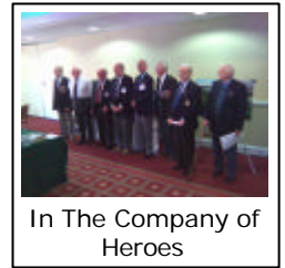
In The Company of Heroes