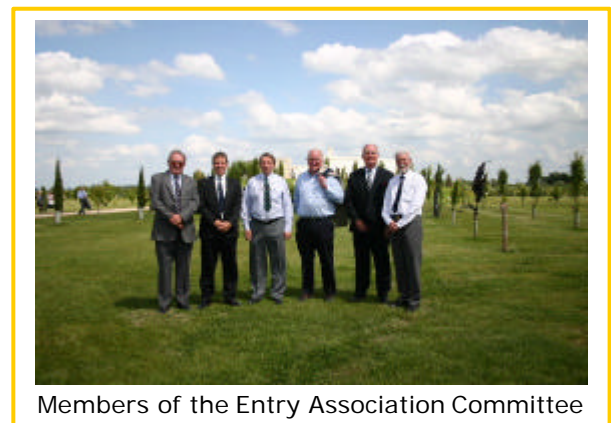
Members of the Entry Association Committee

The Halton Grove is in excellent condition and is looked after by a working group from the 207 th Entry. It is well worth a visit should you be in the area.