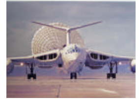
Victor K2 Tanker See inside story