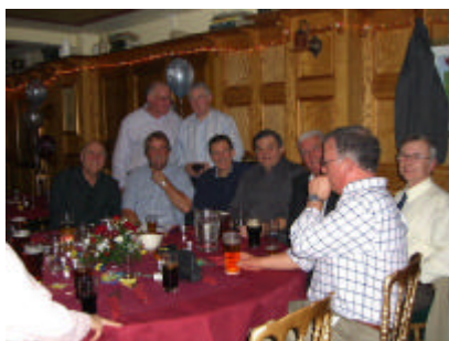
The Mini Reunion